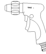
MEDIUM DUTY GUN HUG7943