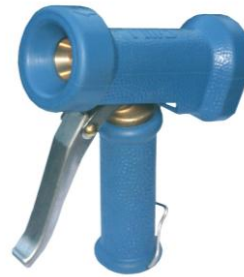
HU15NTBIL Heavy duty washdown gun with adjustable spray

Medium Duty Spray Gun more suited to domestic and light commercial applications such as gardens, garden centres and caravan sites.