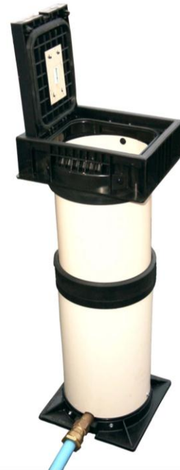
HUBG with 25 mm MDPE Inlet pipe shown