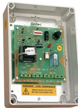
Level Controller (lid removed) acts as junction box – IP65 Single unit dims -