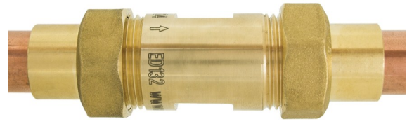
Model ED22SU132 22 mm Double Check Valve with Solder Unions