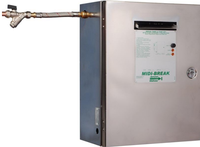
Model shown – BTMIDI-3A