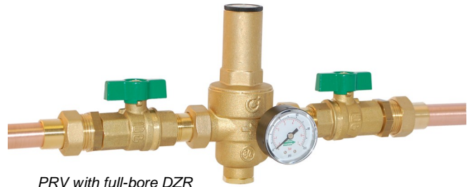
PRV with full-bore DZR servicing valves and solder unions for secure fitting to copper pipe.

Notes Velocity based on flow of water through the bore of copper tube table X. See Flow Table to find the actual flow rate. Valves tested with 6 bar inlet pressure. Outlet set to 4 bar with no flow. Outlet pressure reduces due to frictional resistance and valve characteristics.