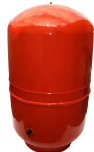
Expansion Vessel model - EVCP