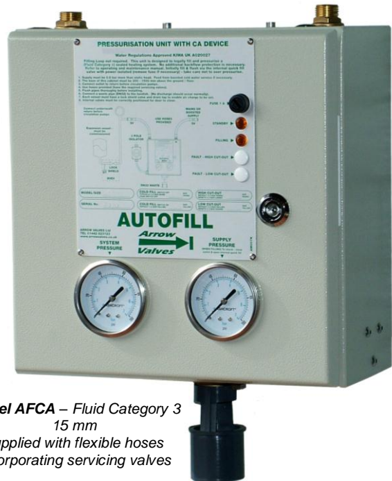
Model AFCA – Fluid Category 3 15 mm supplied with flexible hoses incorporating servicing valves

Autofill utilises the supply pressure for pressurising the system. Often the supply will be mains pressure. The pressure drop across the Autofill is 0.6 bar (6 m). Therefore the mains pressure can reliably be used for single storey buildings (although normally sufficient mains pressure for ground and 1 st and possibly 2 nd floors). For taller buildings, Autofill should be supplied from the domestic boosted cold water supply if available. Autofill's integral backflow protection means the supply can be the drinking (wholesome) water service. Note – where the unit is installed in roof top plant room – the standard filling pressure is sufficient since the system is below.